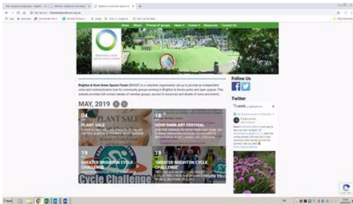
The BHGSF website Home page colourfully displays member group events every month.

Please do EMail the Forum at bhgsforum@gmail.com with any questions